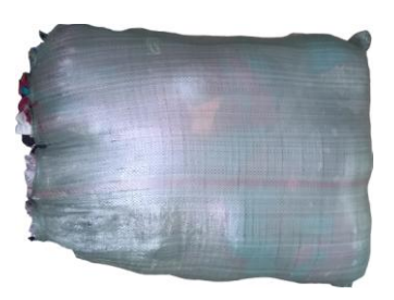
Figure 4: Package of finished products

Given the nature and purpose of use of each different industry, the plant always adjust the products to suit the requirements of each customer to meet the need in the best way and then cut costs in production.