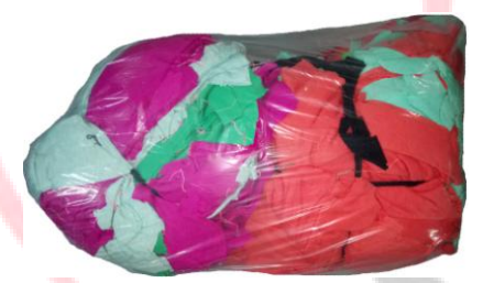
Figure 2: 10kg finished bag