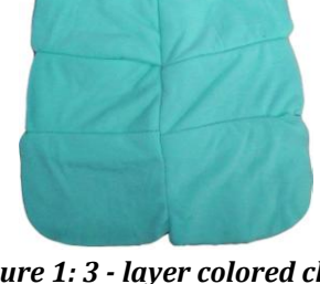
Figure 1: 3 - layer colored cloth