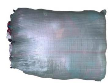
Figure 4: Package of finished products

Given the nature and purpose of use of each different industry, the plant always adjust the products to suit the requirements of each customer to meet the need in the best way and then cut costs in production.