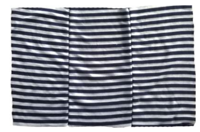
Figure 1:3 - layer colored cloth