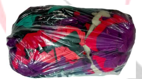
Figure 2: 10kg finished bag