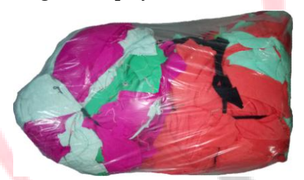
Figure 2: 10kg finished bag