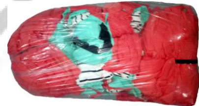
Figure 3: 15 kg finished bag