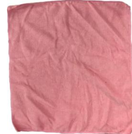
Figure 1: Non-sewing towel