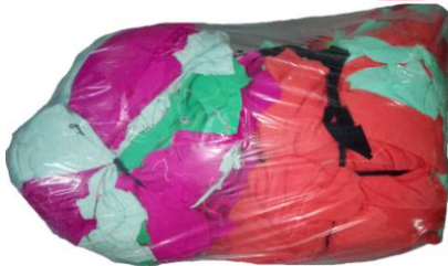
Figure 2: 10kg finished bag