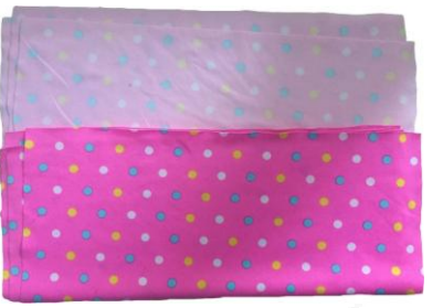
Figure 1: 1 - layer polyester cloth

Given the nature and purpose of use of each different industry, the plant always adjust the products to suit the requirements of each customer to meet the need in the best way and then cut costs in production.