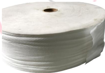
Figure 2: 10kg finished roll