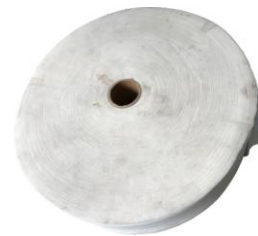
Figure 3: Finished roll (hip side)